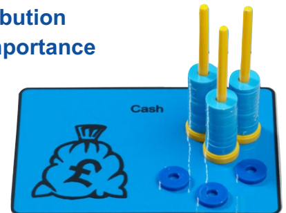
A pic of a small part of one of our games