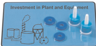
A pic of a small part of one of our games