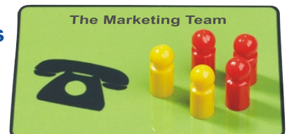
A pic of a small part of one of our games

The Business Experience incorporates your key course objectives and brings them to life