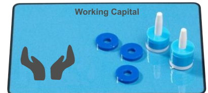
A pic of a small part of one of our games

We write bespoke course notes for every course. We cover issues relevant to the delegates and can include exercises to broaden and deepen their experience.